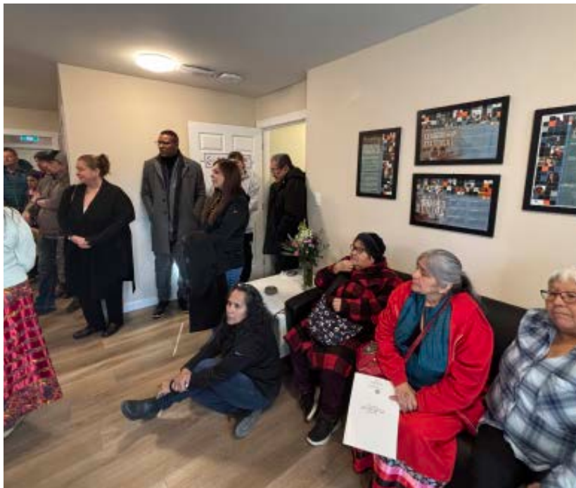
People wait to tour es zúmin' Primary Care Centre now open in the SSHS building.