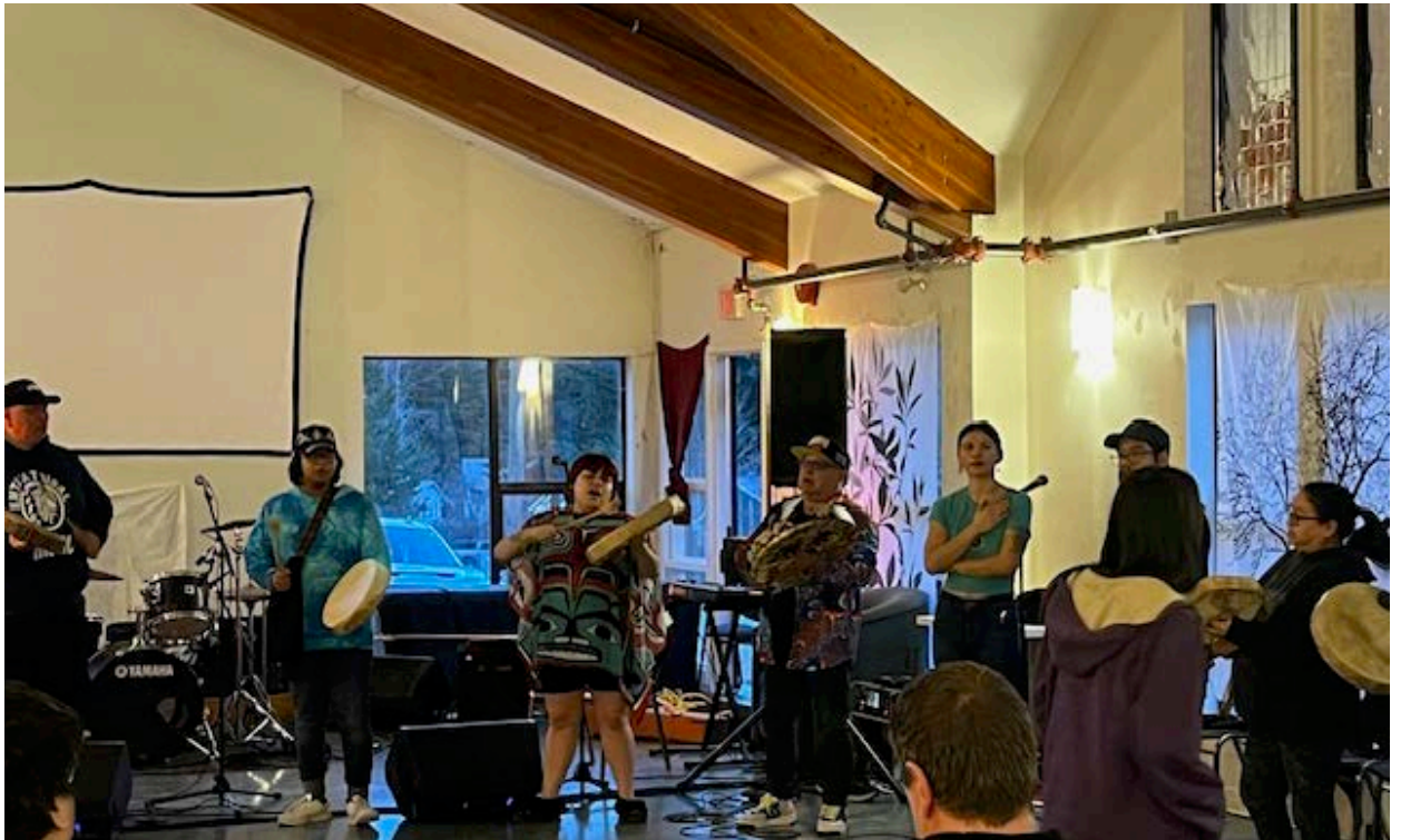
The Sobriety Bash at Q'aLaTKu7eM in March brought out a crowd to sing, dance and have a great time. A second Sobriety Bash was held in N'Quatqua.