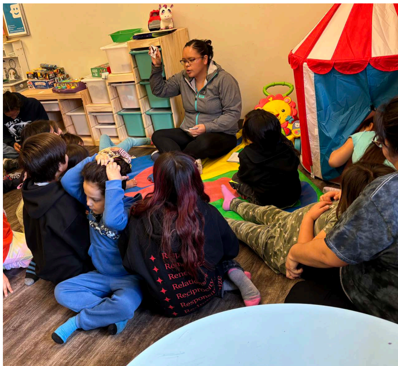
Playgroups are an essential part of ECD's work in Q'aLaTKú7eM and Skatin.

After a relatively mild winter we are ready for warmer weather and are excited to get back out on the land. Over winter the ECD team focused on opening more days and improving our regular programming with our Skatin and Q'aLaTKú7eM Playgroups. We spent much time converting our new space at the Skatin Community School to promote safety, inclusion and exploration for our Playgroup families. We worked so well that the school decided to relocate their library to a new room so we could further utilize the space, stay tuned for new equipment coming to that program soon. ECD