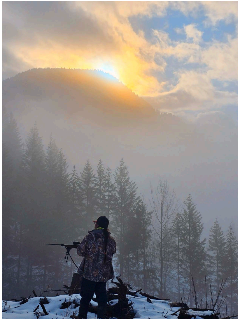
Hunting out on Stl'at'imx territory as dawn breaks over the mountain making a beautiful morning.