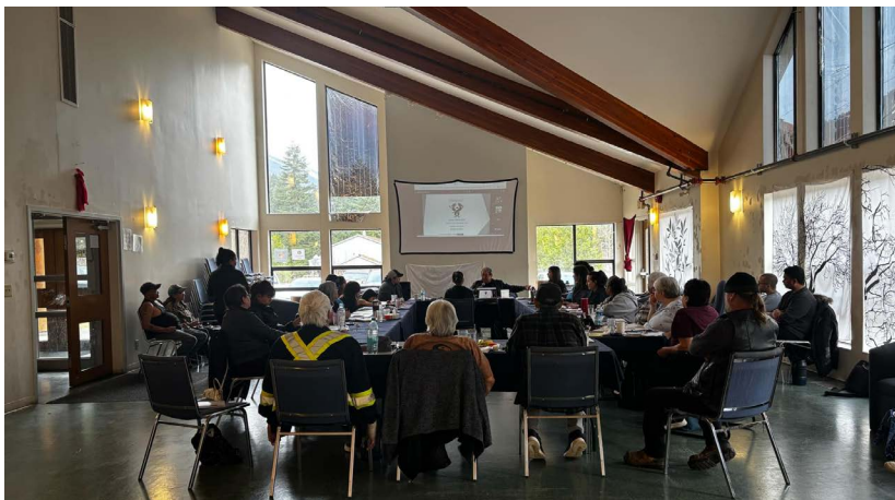
SSHHS's AGM was held on March 29, 2025 at the Samahquam Multiplex.

The by-law amendments follow years of board discussions, and