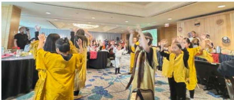
Skatin Community School dancers show their best moves at the FNHA Regional Caucus in Vancouver.