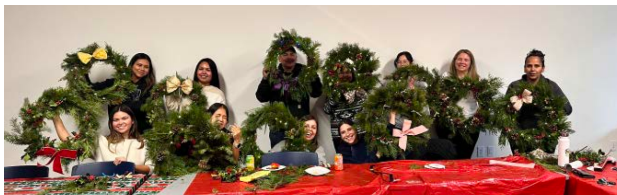
The SSHS Team got into the spirit of the season with a little wreath making. Wreath making workshops were also given in the SSHS communities.

https://nctr.ca/news-and-events/community-events/community-information/