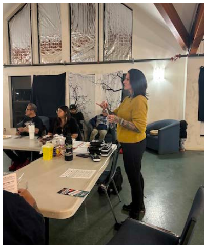
National Addictions Awareness Week dinner in Samahquam was well attended,