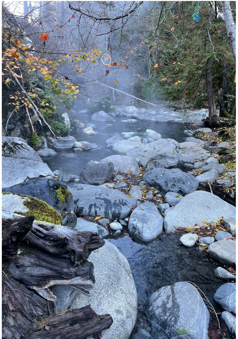
Getting community members out onto the land was an essential part of Útszan ti Smáwala's healing work.

Pemberton Secondary School has supported a community member in using her voice to spread awareness around consent. There is now a beautiful bench at the school painted with Consent is Respect and hand prints that represent all those who have helped her on her healing journey.