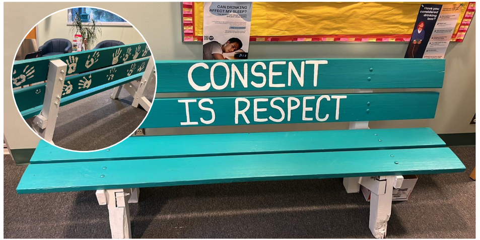
"Consent is Respect" was a theme Útszan ti Smáwala adopted for Sexual Assault Awareness Month in April 2023..This bench (back detail inset) was created Pemberton Secondary School.

These types of training opportunities and conferences are important to attend because the government doesn't understand the geography we have to deal with here. Explaining to them where we are, the dangers to travelling on active FSRs, and the length of time it takes to get medical attention, is important for them to understand.