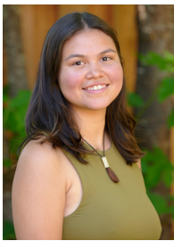
Executive Assistant/ Patient Travel