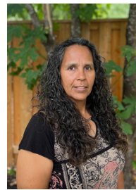
Front Desk/Admin Assistant