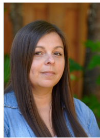
Program and Contracts Manager