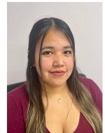
Early Childhood Development Assistant