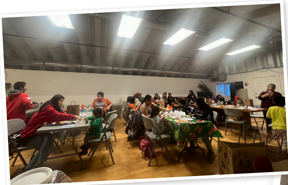
It was a full house in Tipella for Xa'xtsa's Christmas Craft Night.