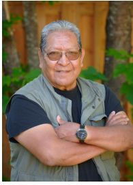
Interim Health Director