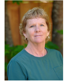
Interim Health Lead /Physiotherapist