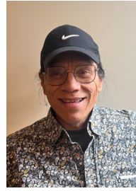
Men's Health Lead