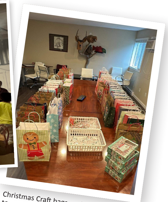
Christmas Craft bags packed up and ready to go at the SSHS office.

Thank you to all the SSHS families that came out and made ECD's Family Christmas Craft Nights a success!