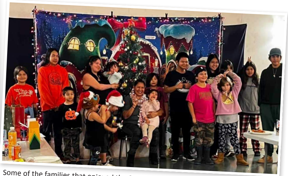
Some of the families that enjoyed the Samahquam Christmas Craft Night.