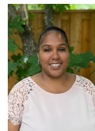
Early Childhood Development Coordinator