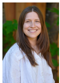
Family Preservation & Reunification Worker